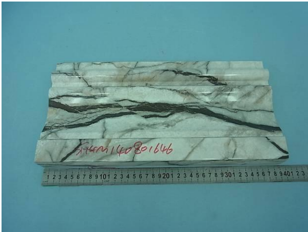
Original sample (front view)